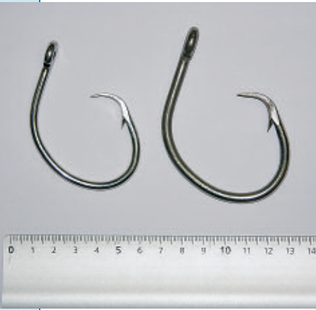
Two different sizes of circle hooks.

Based on his review of the details and experimental design of the four research studies, Read makes the following conclusions: