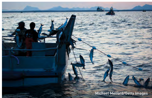
Salmon fishing in Alaska (top). Male sea lions in Newport, Oregon, at the Historic Newport Docks (bottom left). Driftnet fishing for sockeye salmon along the Nushagak River, Alaska (bottom right).