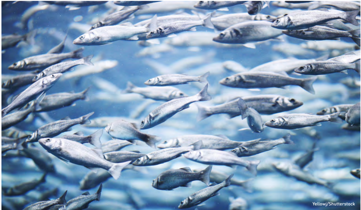
A school of mackerel.

The full report and a companion Implementation Volume providing extensive guidance on developing FEPs are available at www.LenfestOcean.org/EBFM .