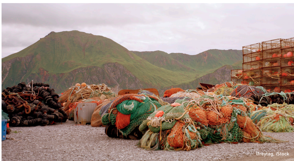
Cover photo: Fishing boats, Valparaiso, Chile