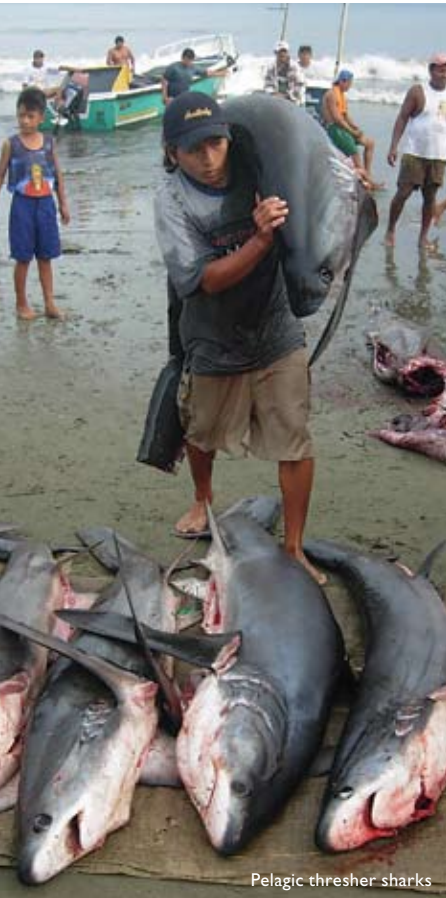
Pelagic thresher sharks