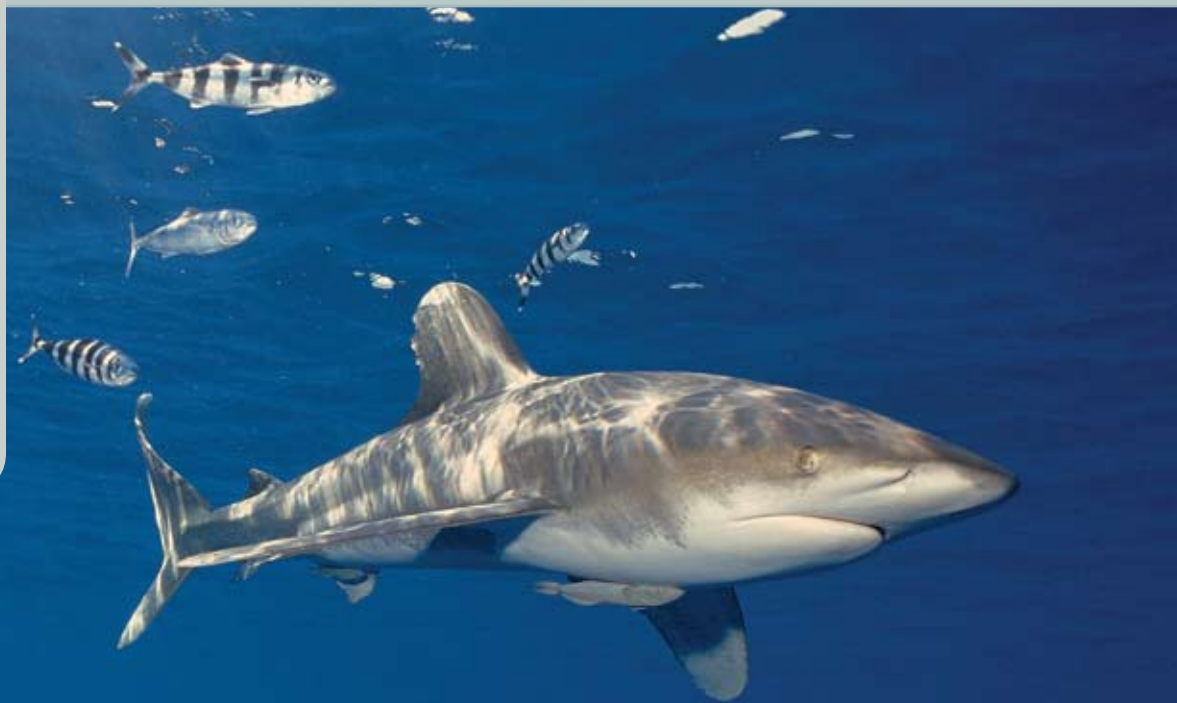
Oceanic white tip shark

Although the United Nations Food and Agriculture Organization (FAO) adopted the International Plan of Action for Sharks (IPOA-Sharks) in 1999, its provisions are voluntary and implementation has been slow. Finning bans have been introduced in many countries and in most Regional Fisheries Management Organizations (RFMOs), but enforcement measures tend to be lacking. To date, no international catch limits for sharks have been adopted by the RFMOs that manage fisheries catching sharks.